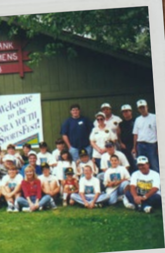
South Sportfest was a precursor to Day started by Wisconsin Field Rep his wife and two others in 1994.