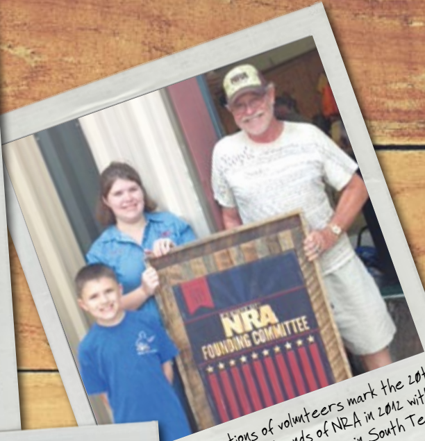
3 generations of volunteers mark the 20th Anniversary of Friends of NRA in 2012 with the Brazos Valley committee in South Texas