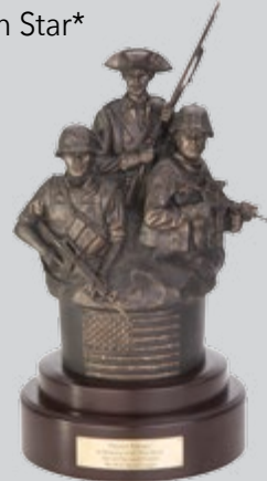
Patriot Tribute Sculpture