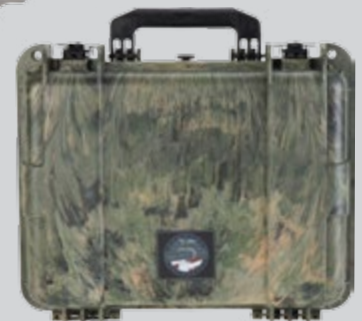
H15 Compact Double Handgun Case with Anniversary Logo*