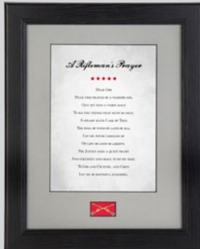
Rifleman's Prayer Framed Art*