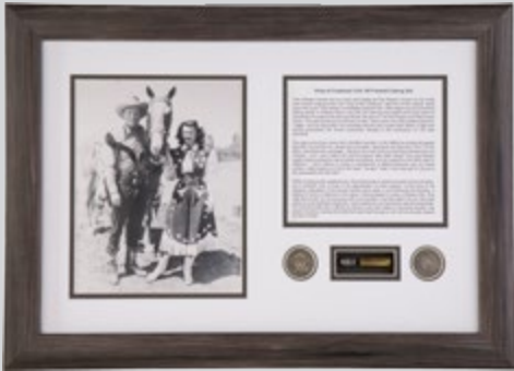
Roy Rogers Commemorative Set*