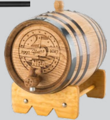
Whiskey Barrel with Anniversary Logo*