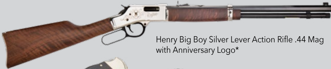
Henry Big Boy Silver Lever Action Rifle .44 Mag with Anniversary Logo*