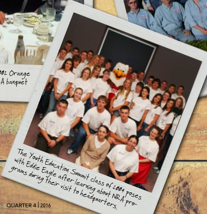
The Youth Education Summit class of 2004 poses with Eddie Eagle after learning about NRA programs during their visit to headquarters.