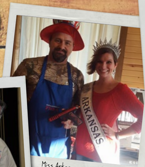
Miss Arkansas joins in the patriotic fun and fundraising at an event in her home state.