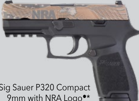
Sig Sauer P320 Compact 9mm with NRA Logo**