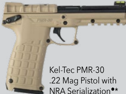
Kel-Tec PMR-30 .22 Mag Pistol with NRA Serialization*