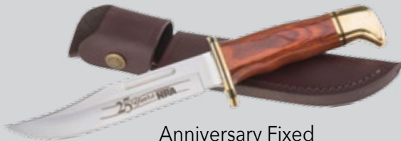
Anniversary Fixed Blade Knife*