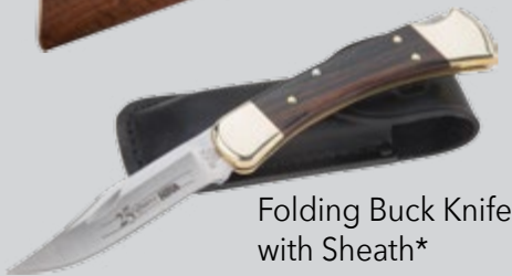
Folding Buck Knife with Sheath*