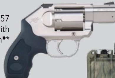
Kimber K6s™ .357 Mag Revolver with NRA Serialization**