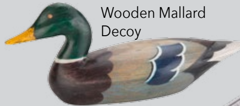
Wooden Mallard Decoy