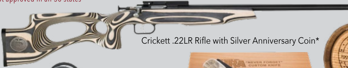
Crickett .22LR Rifle with Silver Anniversary Coin*