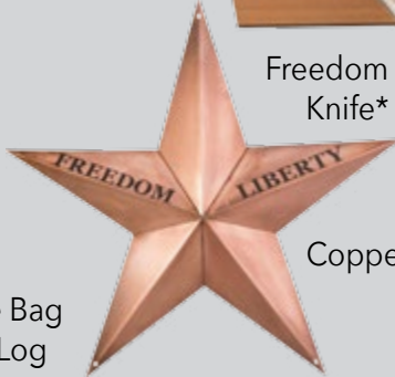
Copper Barn Star*