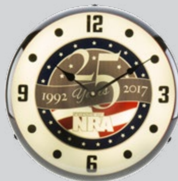
Clock with Anniversary Logo*