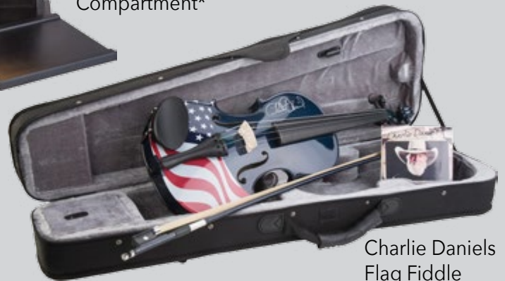
Charlie Daniels Flag Fiddle