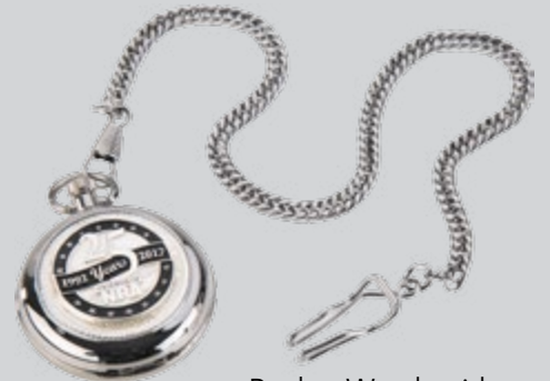
Pocket Watch with Silver Anniversary Logo*