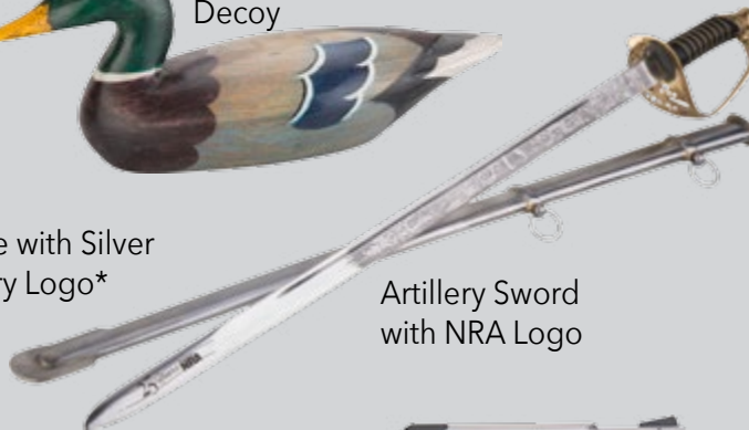
Artillery Sword with NRA Logo