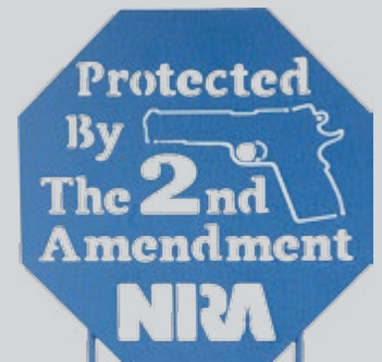
Security Yard Sign*