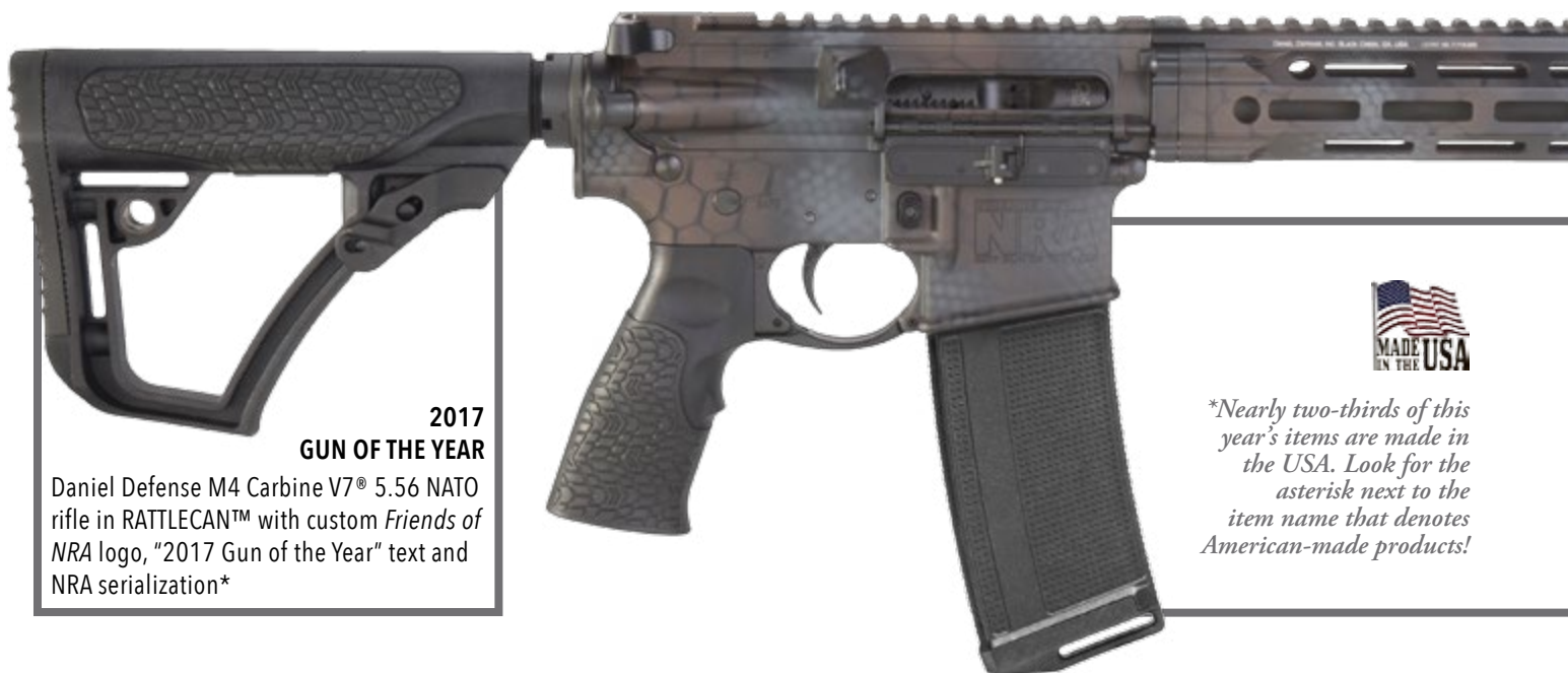
2017 GUN OF THE YEAR

For the first time ever, an AR-15-style rifle has earned the Gun of the Year title.