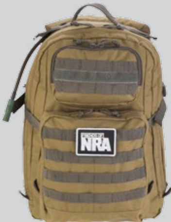
Backpack with Hydration and Logo