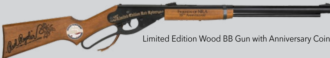
Limited Edition Wood BB Gun with Anniversary Coin*