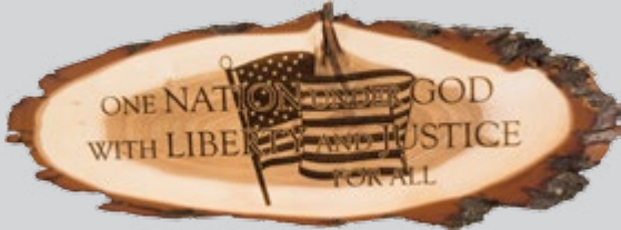
Pledge of Allegiance Wooden Sign*