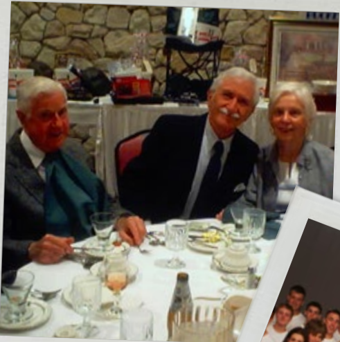
Attendees at the 2002 Orange County Friends of NRA banquet in New York.