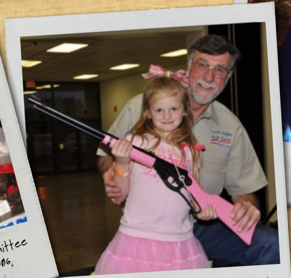
A young attendee of the 2010 Baytown Area event in South Texas got to take home a new BB gun.