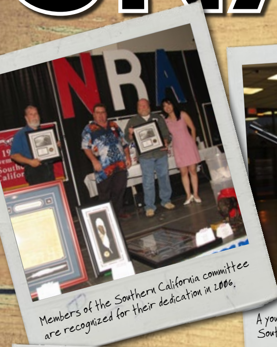
Members of the Southern California committee are recognized for their dedication in 2006.