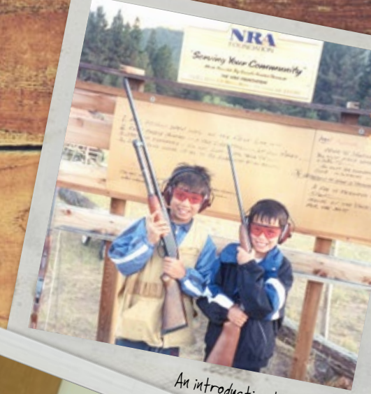
An introduction to shooting made possible by grant support.