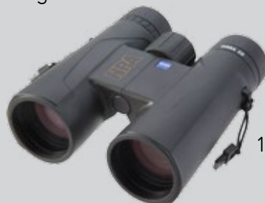
ZEISS Terra ED 10x42 Binoculars with NRA Logo