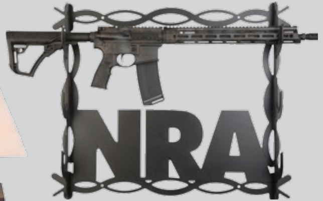
Gun Rack Display*