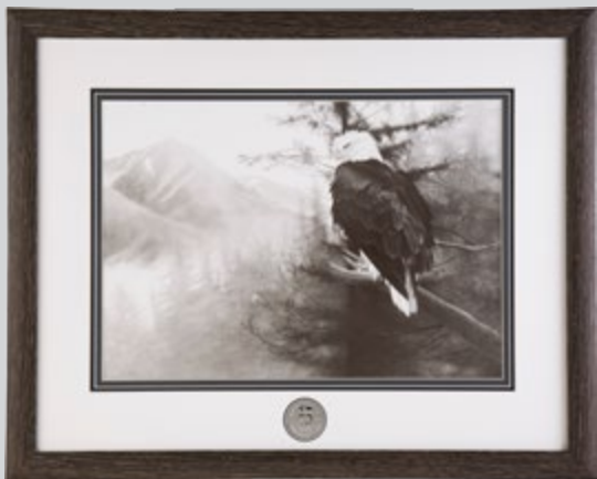
Standing Guard Anniversary Edition Print*