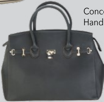
Concealed Carry Handbag