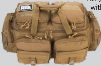
Range Bag with Log