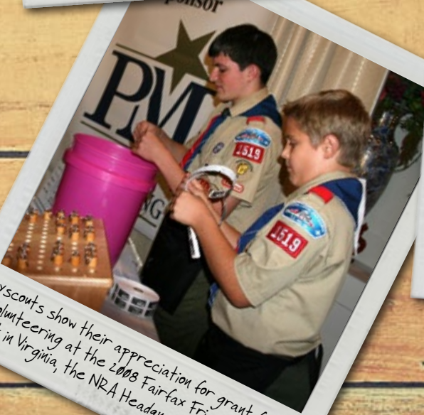
Boyscouts show their appreciation for grant funding by volunteering at the 2008 Fairfax Friends of NRA event in Virginia, the NRA Headquarters local event.