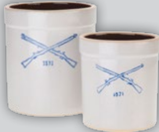
Stoneware Crocks - Set of 2*