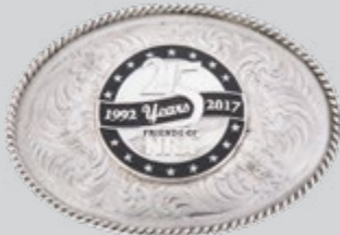
Belt Buckle with Silver Anniversary Logo*