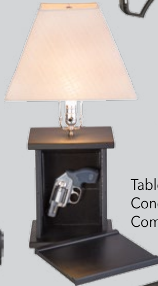
Table Lamp with Concealed Compartment*