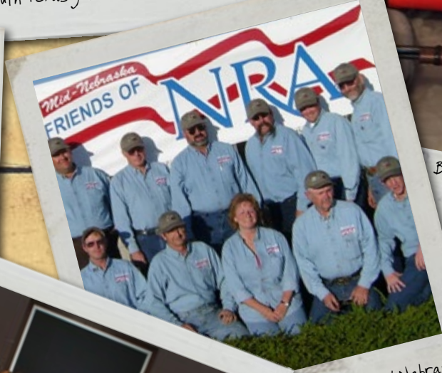
The Mid-Nebraska Friends of NRA committee