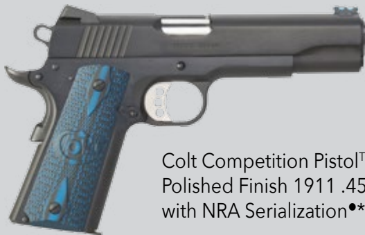
Colt Competition Pistol™ Polished Finish 1911 .45 ACP with NRA Serialization**