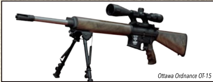
Ottawa Ordnance OT-15