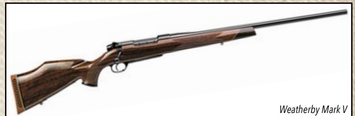
Weatherby Mark V

Henry salutes the American Farmer with this tribute edition featuring detailed scenes of farming life etched into the receiver and splashed with gold, with additional images lovingly carved into the American Walnut stock. It's a .22 caliber work of art to carry, use and display with pride, carrying our message of heartfelt gratitude to a hundred generations, past and present, who feed our world. The rifle is chambered in .22S/L/R.