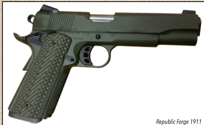
Republic Forge 1911

The Watchman is a .300 WIN Mag upgrade from the NEMO Match OMEN, built for the discerning long range shooter and hunter. NEMO gave it a longer 24" barrel for more velocity, built-in 20 MOA picatinny rail on top of both the handguard and receiver. NEMO made this rifle extra rugged with a 7075 billet machined aluminum handguard and paired it up with the billet machined 7075 matched aluminum receiver set. This special Freedom Edition rifle features red, white and blue Cerakote and is proudly made in Montana.