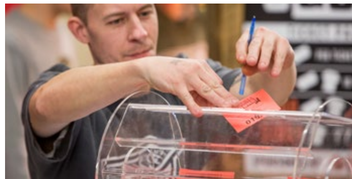
PHOTOS Opposite: An Americana-themed item from the silent auction at The NRA Foundation Banquet. This page, from top: Great American Outdoor Show attendees visit the Wall of Guns; Raffle girls wearing custom Wall of Guns shooting shirts donated by Gaston J. Glock style LP sell tickets; A Wall of Guns participant places his ticket in the tumbler and awaits the winner selection.